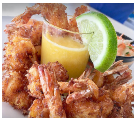
Our Famous Coconut Shrimp 35 Shrimp rolled in coconut crumbs and our special breading and fried crispy.