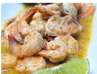
Garlic Shrimp 35 Shrimp sautéed in a zesty garlic sauce.